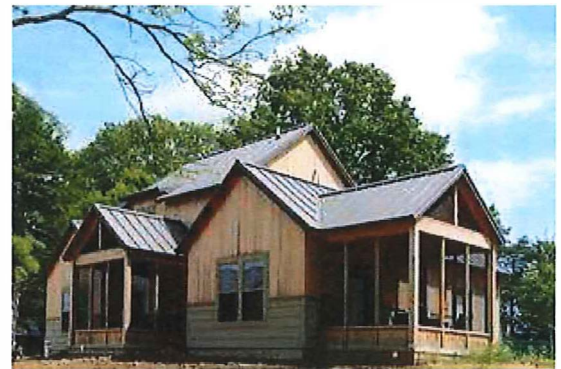
CEDAR CREEK CONFERENCE CENTER

“We’re adding more new cottages to our room mix in response to growing demand from people taking multiday tours of area wineries and other regional